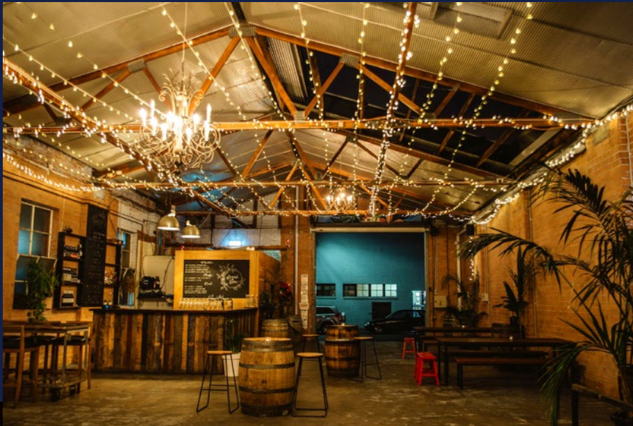
Moon Dog OG (Abbotsford)

Still not quite what you were looking for? Check out our other venues around Melbourne that offer a wide variety of unique spaces, capacities and food and drink options.