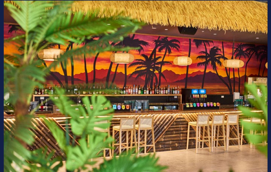
Moon Dog Beach Club (Frankston)