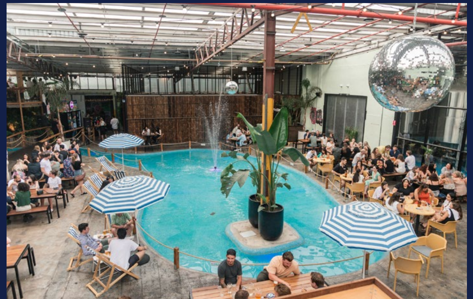
Moon Dog World (Preston)