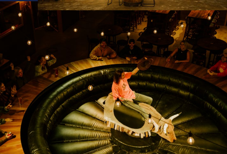
Moon Dog Wild West (Footscray)